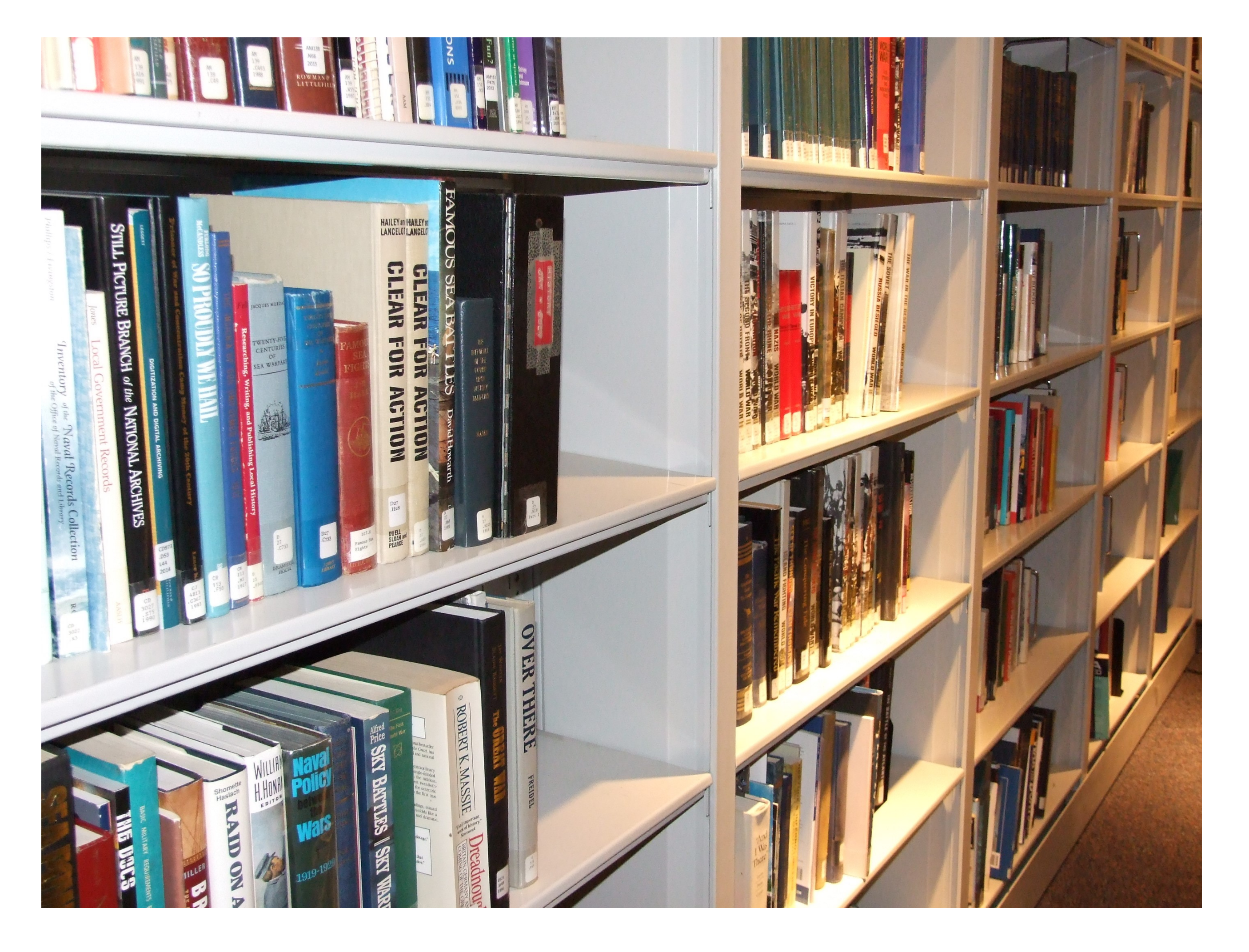
Materials are for use in the library only, but interlibrary loan is possible for non-fragile items.